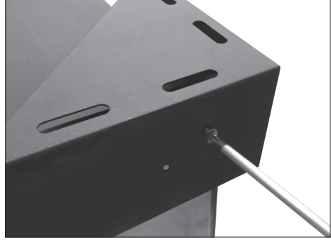
Fix mounting screws through the rear heat shield