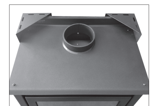
Corner shield installation complete

Wee Rad-Leg and Ultra Wee Rad model fixing points