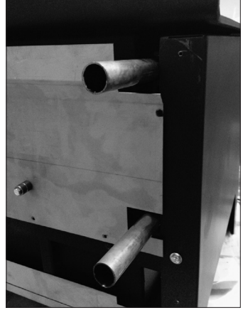
Classic rad fastening positions for the side wetback