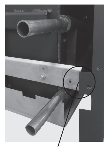
Right hand M6 bolt undone and side panel 'spread' for access