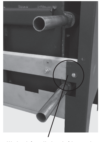
Wetback installed and side panel re-fastened. Heat shields to go back on for completion